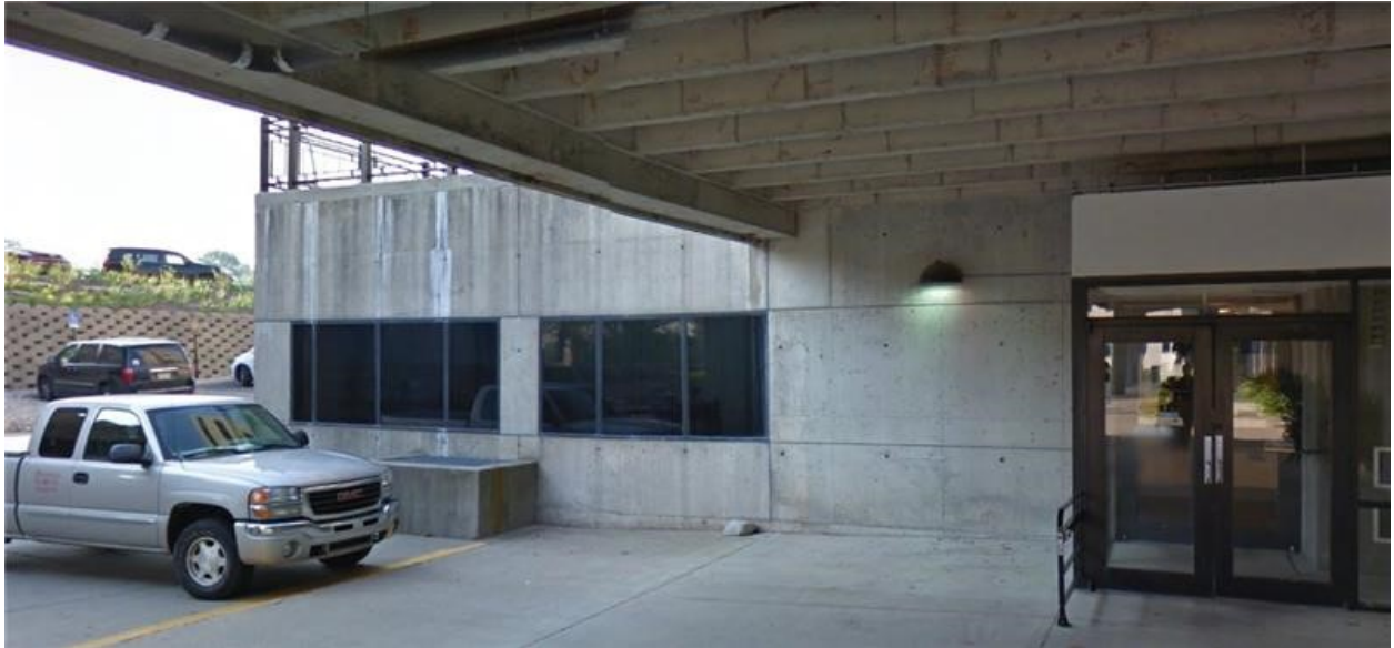
Photo at Wall Panel Repair looking at Administrative Building (below)