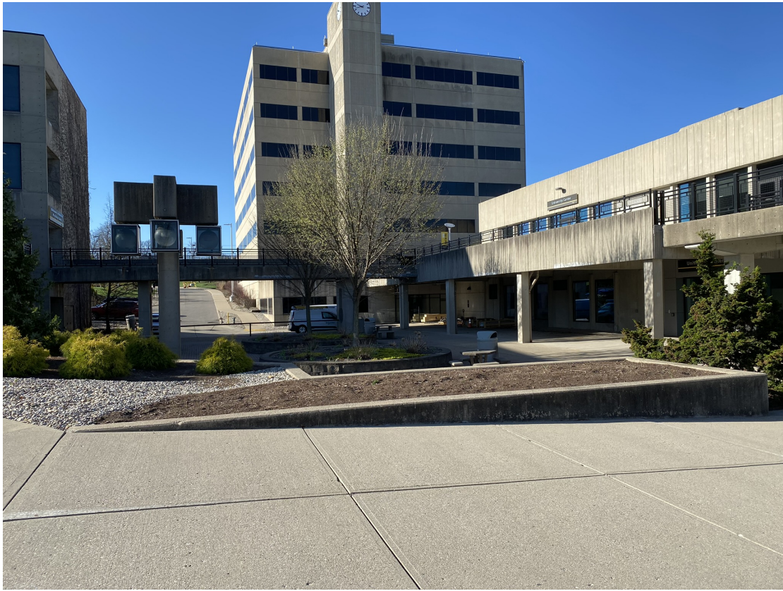
Photo at Overall of Wall looking at Administrative Building