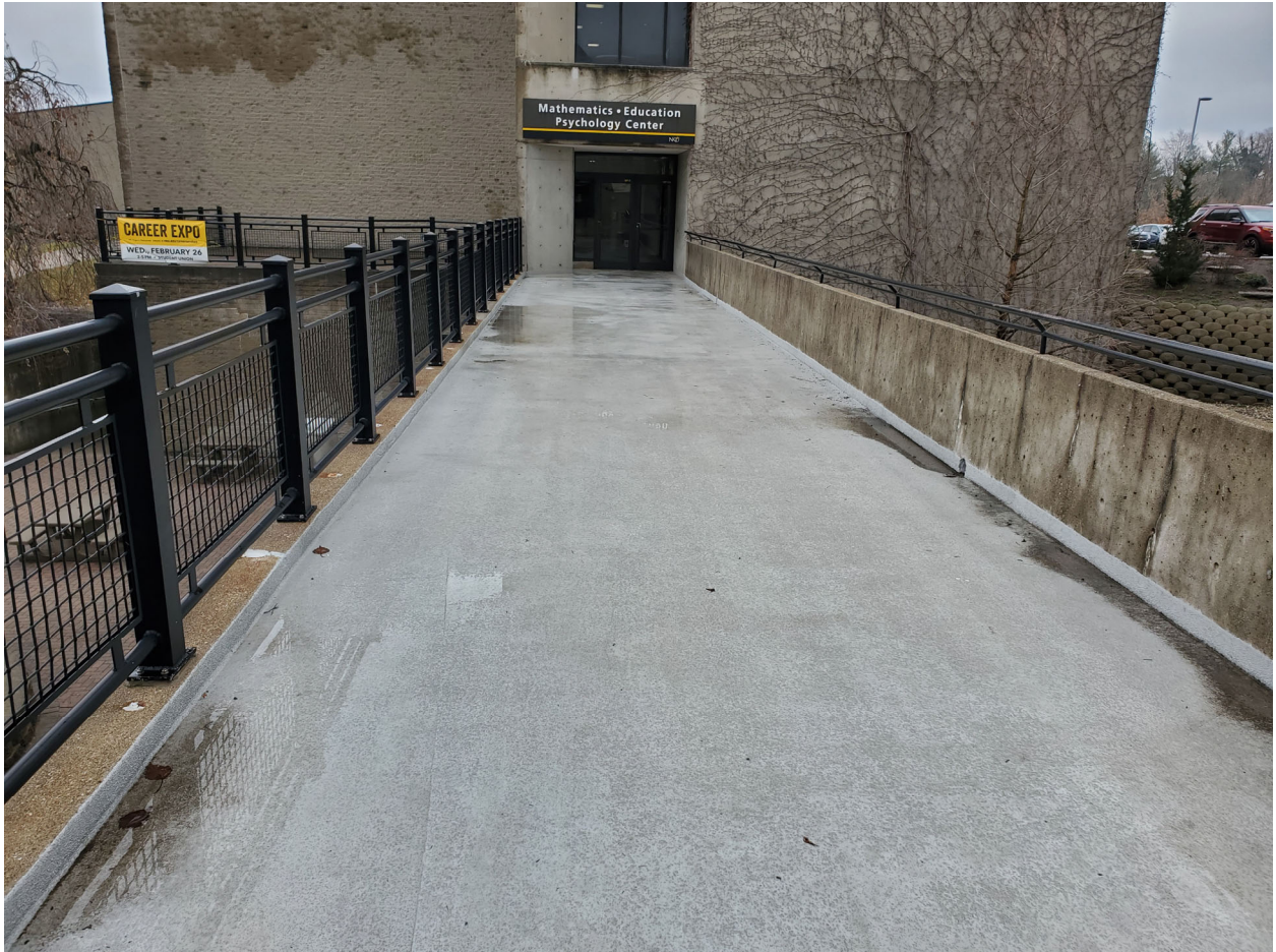
Photo at Bridge, ponding conditions